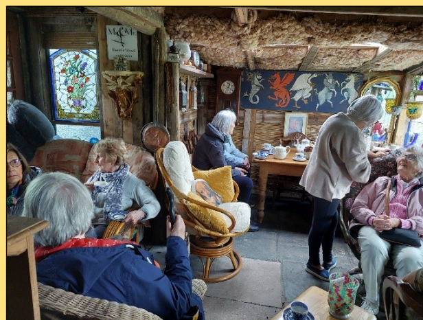
In the Bothy